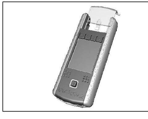
Figure 1. EvoPrimer base Figure 2. EvoPrimer target boards